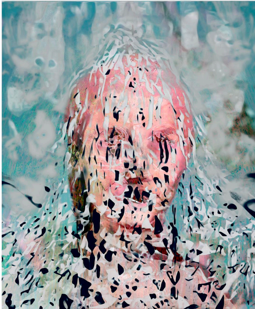
Adobe Mask, 2012