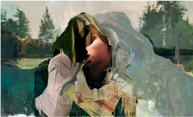
Opposite Page Grandfather Wreath, 2010 This Page Untitled Body Landscape (Part 1), 2007

introduction to an artists work and is affordable for a collector on any budget. I was fortunate enough to have made a connection with Wassenaar publishing and so it seemed apt to produce a limited edition publication basically introducing myself with a catalog of early works. It also offered up a written interview and description of my artistic process, which is still a primary talking point when someone sees my work for the first time.